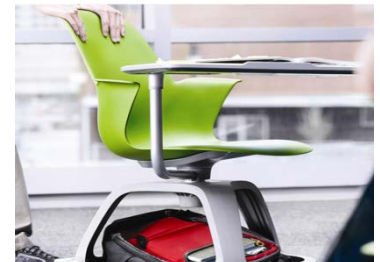
Figure 1: Node chair from UMich